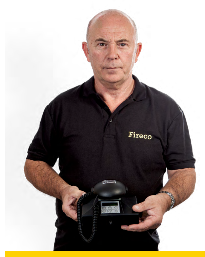
Deafgard also uses a radio transmitter for loud and busy environments